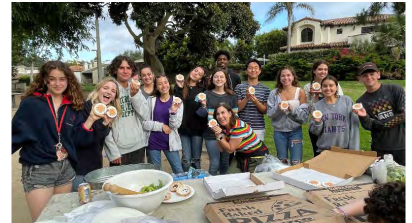
The SBFC Youth Advisory end of year celebration